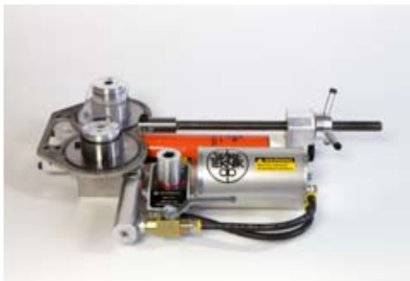
An example of A200 fitted with Hydraulic pump unit PHU1.