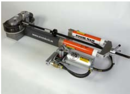
An example of A350 fitted with Hydraulic pump unit PHU1.