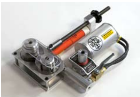
Without Handpump, 13 kg (29 lbs) with Handpump P19L.