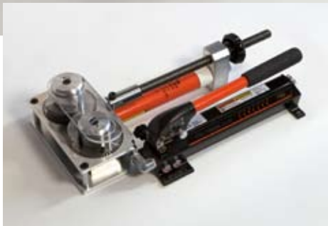
Hand pump P19L is standard equipment.